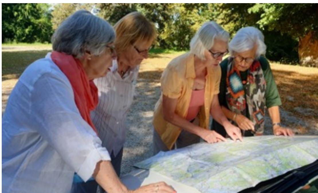
German IFYEs defying the crisis