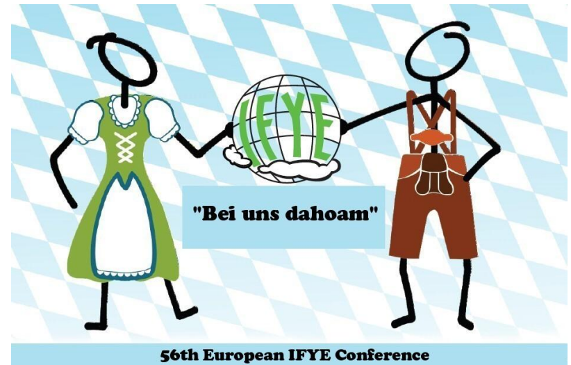
56th European IFYE Conference Hesselberg - Germany, July, 19th - 26th 2014