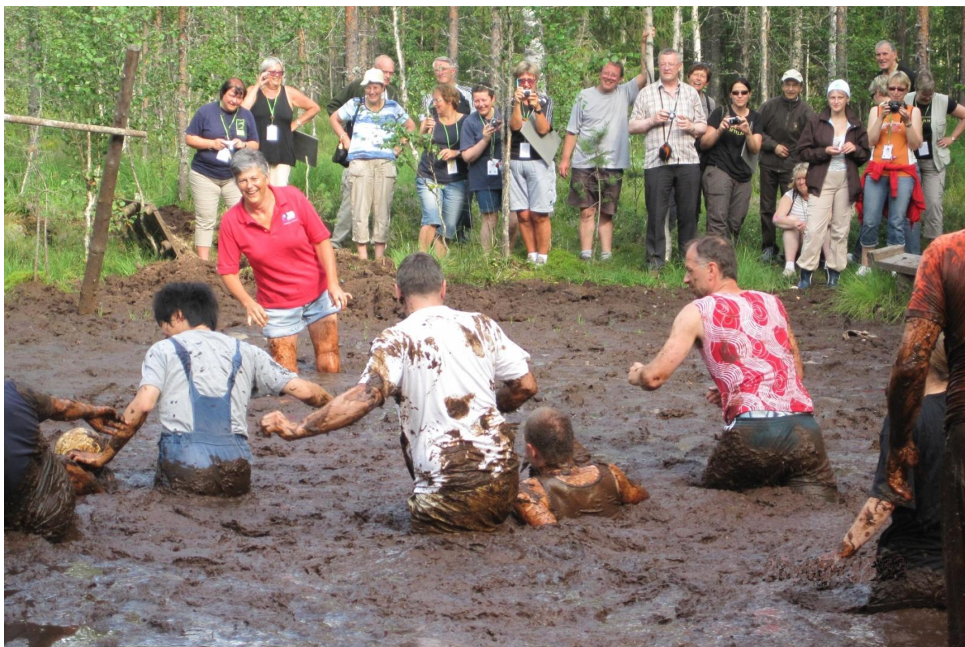
IFYELand 2011: Swamp Soccer – new challenges and great sportsmanship