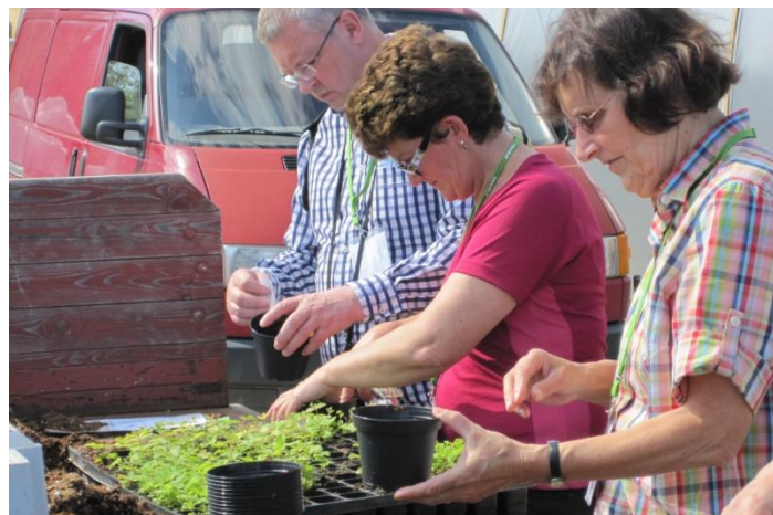
Peuraniemen Taimitarha (nursery garden)

It was long days and short nights of fun and rumours says the warmest week in Finland for 23 years. It was another fantastic conference! Thanks to all the crew in IFYELand that made it a special week for the rest of us.