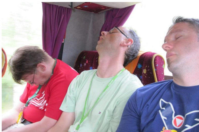
"Sleeping beauty tour" (?)