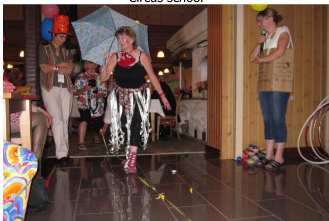
... what did I learn in school....

We were formed in teams from the first day and through out the week the teams took part in various events in the "Summer and Winter Olympics" which included "sort of"-formula 1, beach games, archery, swamp soccer, cross country skiing, kick sledge relay.