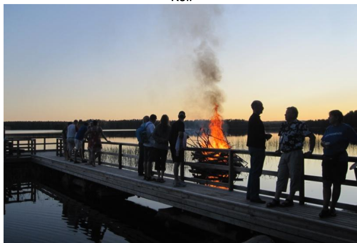
"Midsummer Beach party"