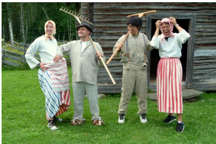
Like they did in the old days...