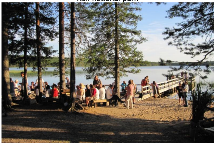
"Midsummer Beach party"