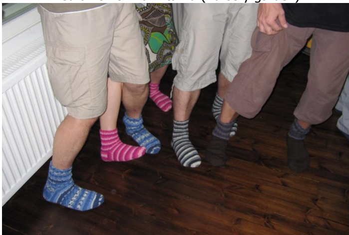
Woollen socks – conference gift and fantastic for dancing