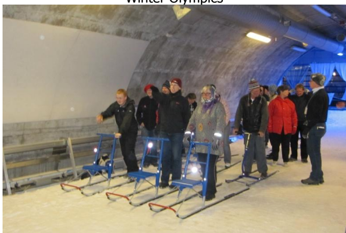
Ski tunnel – ski all year through -6°C