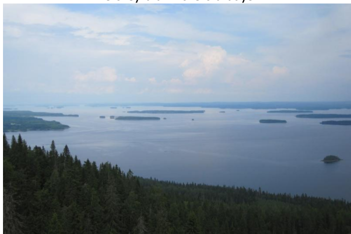
Koli national park