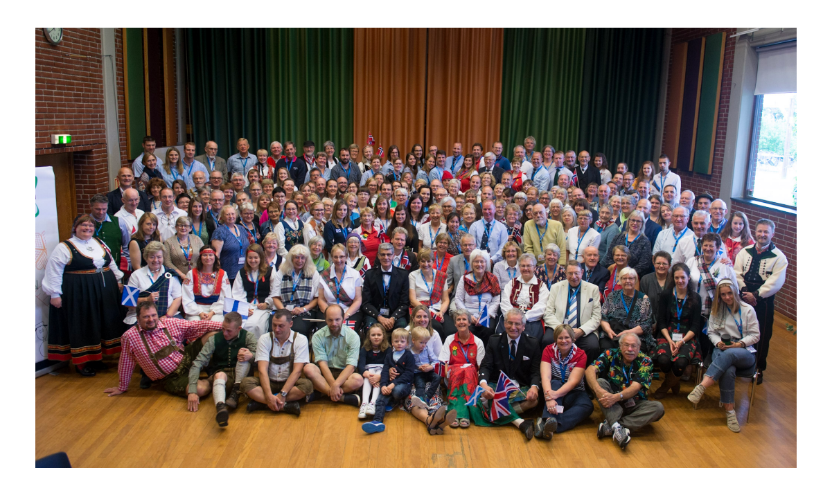
IFYE Conference in Norway 2019