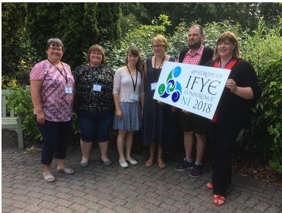
Committee 2018/2019 – Antrim, Northern Ireland