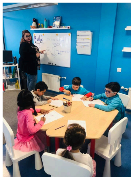
Teaching at Pingu's English School in Tallinn, Estonia 2019.