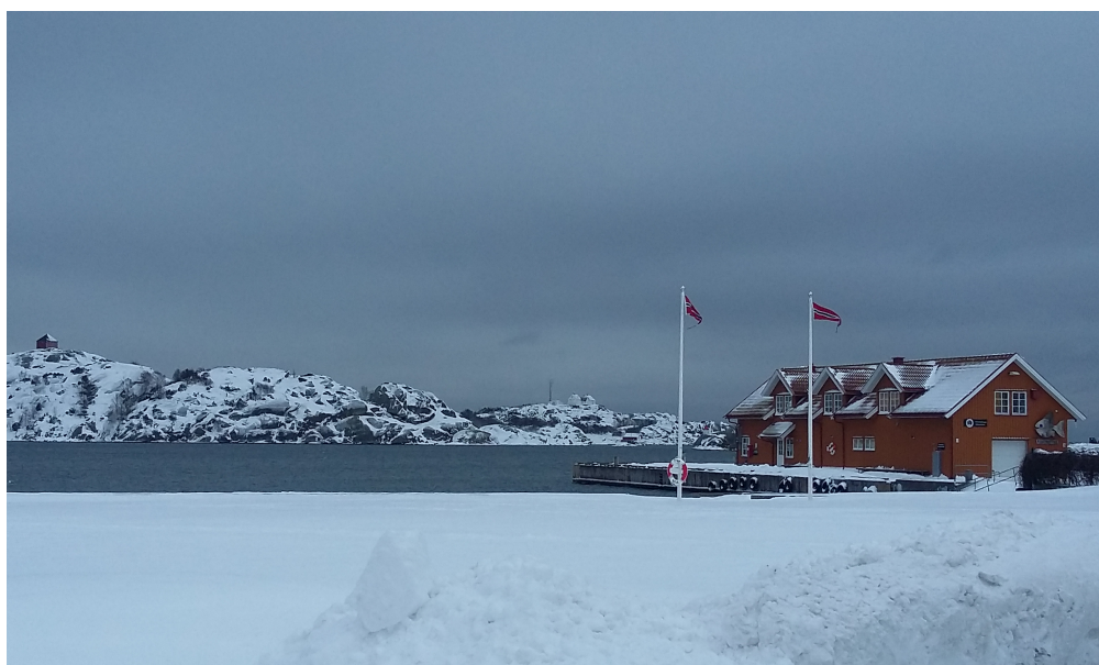
IFYE Mid-term Meeting 2019 – Larvik, Norway