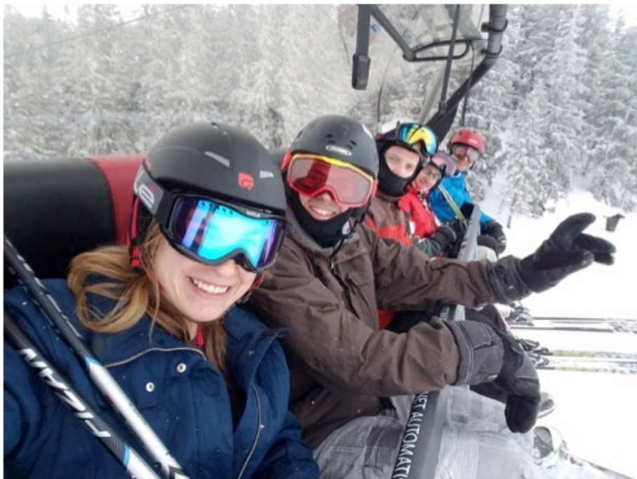
On the way up – Switzerland , USA, Austria and Scotland

While the weekend started with rain, the weather gradually improved until we were sent off on our separate ways with sunshine.