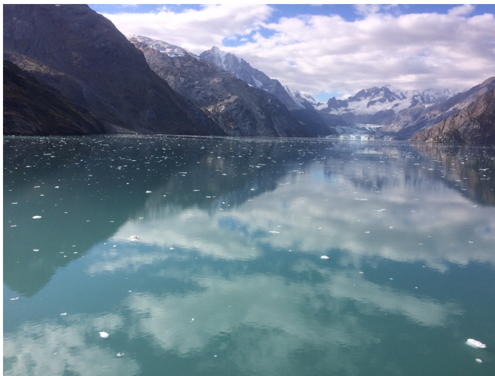
World IFYE Conference – Alaska, USA