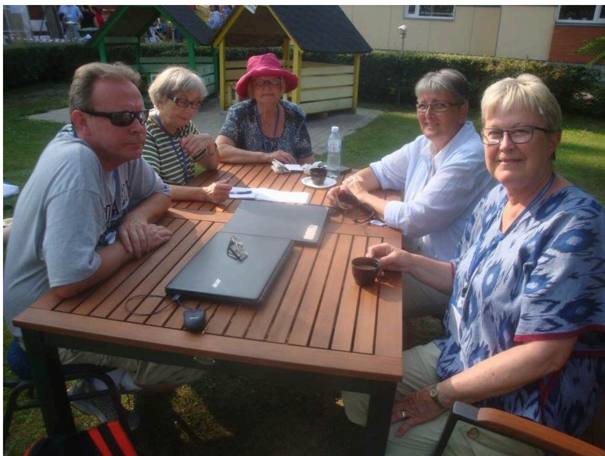
The 60th Anniversary Group