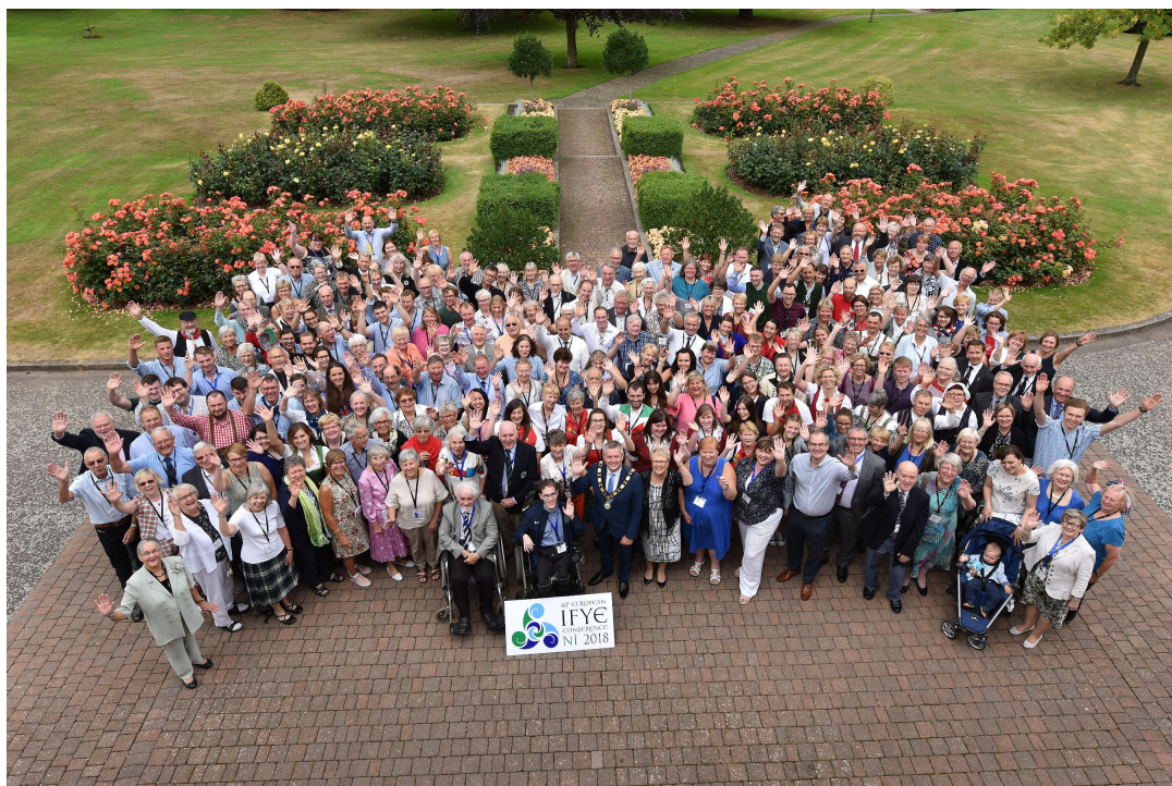
IFYE Conference in Northern Ireland 2018