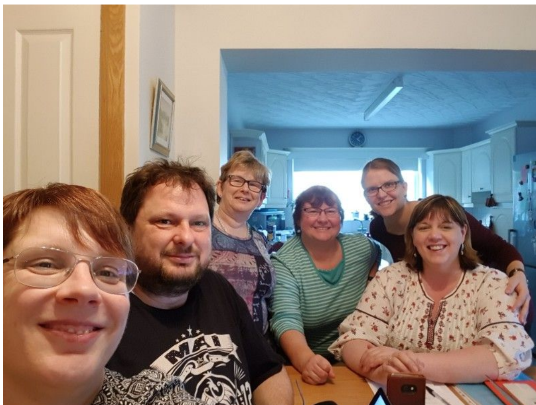
Mid-Term Meeting in Northern Ireland