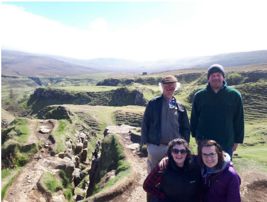
Discovering the Isle of Skye