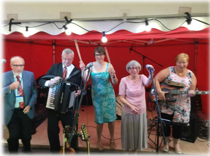
Former and current presidents making music at the European Conference in Estonia