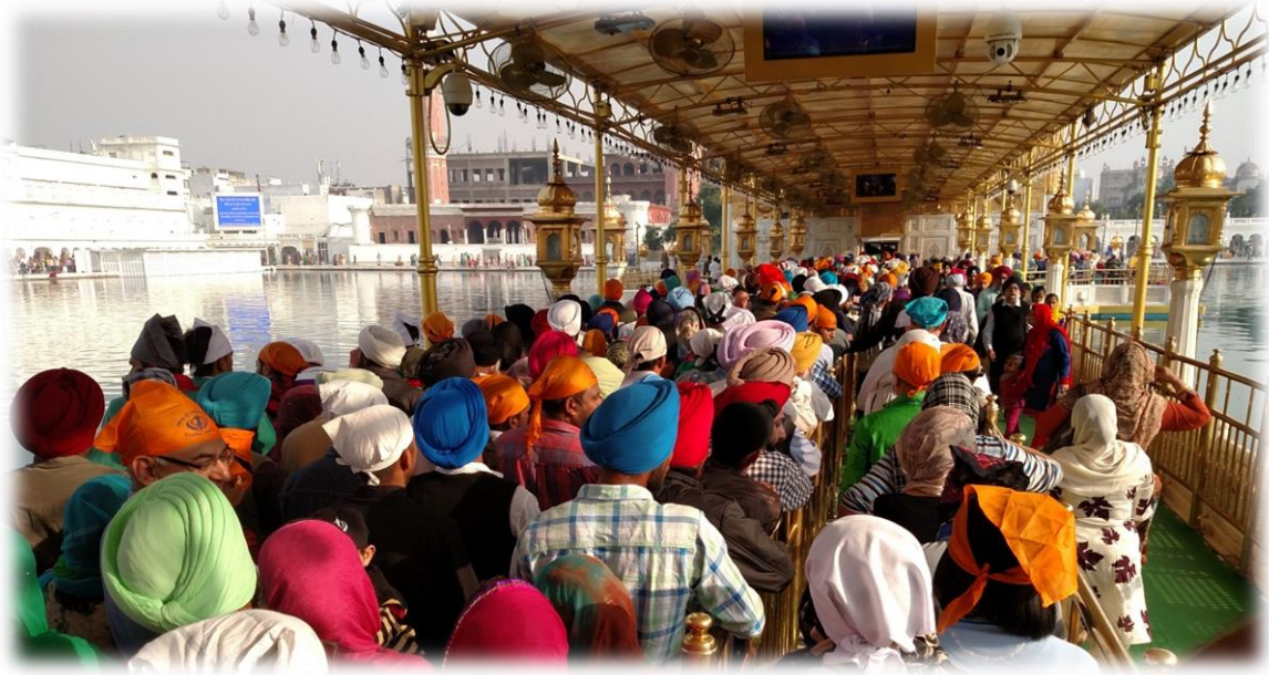
8th Asia Pacific IFYE Conference in India Lines of people waiting to enter the Golden Temple