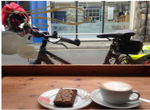
Coffee & Cake in Wales