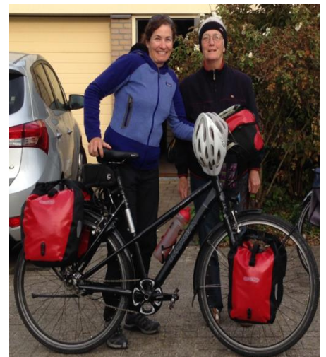
With Iny in Holland

After some cycling days in England, I finally took the train through London to the English East Coast to take the ferry to Holland – the cyclist's paradise. Nice cycling routes along the coast, perfect weather – only the headwind was not on my wish list. But already after six weeks cycling, I had enough power in my legs to reach Amsterdam anyway. Then I was heading south towards Switzerland. But still not stressed, I took some time to visit the Dutch IFYEs. They are so sporty – all of them joined me for some kilometres on my route. Arriving in Germany, I noticed that in only one week, I should arrive home to start work! No more time left to make any extra loops – I followed the River Rhine straight down. Lucky me, three more IFYE visits were possible, before I crossed the Swiss border and the first Swiss mountain range after 8 weeks.