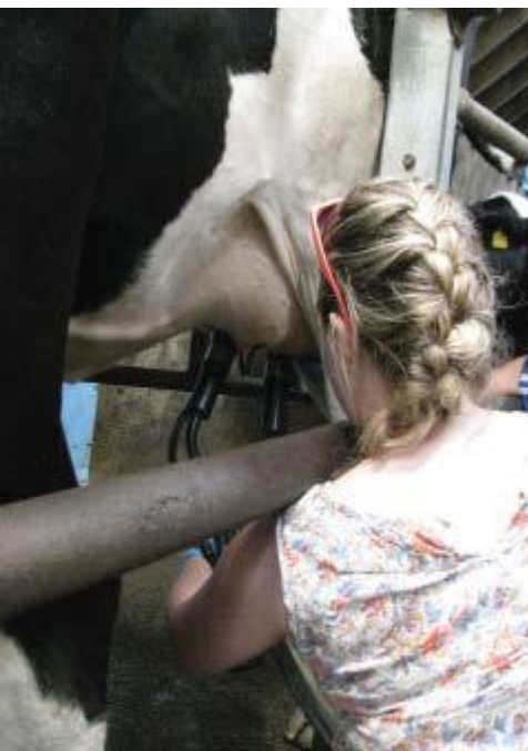
Me - Milking

On Wednesday June 18th we found ourselves back in Edinburgh at the Budget Backpackers Hostel. We spent the evening in anticipation of what the next four days would be like at the Royal Highland Show, and let me tell you I don't think any of us came close to the reality. We each had our own interests at the show; some of us wanted to spend more time in the livestock and agricultural areas, others wanted to see the arts, crafts and shopping marquees, and others fancied socializing with other young people more than anything. I set a personal goal to attend more of the educational and cultural elements of the show such as the sheep showing and shearing, the Grand Parade, the Grand Prix, the Red Hot Chilli Piper's concert and the after-the-show dance. Also during the show, the exchangees were invited to attend the Young Farmers Chairman's reception and the Young Farmers Alumni reception - both of which offered excellent networking opportunities.