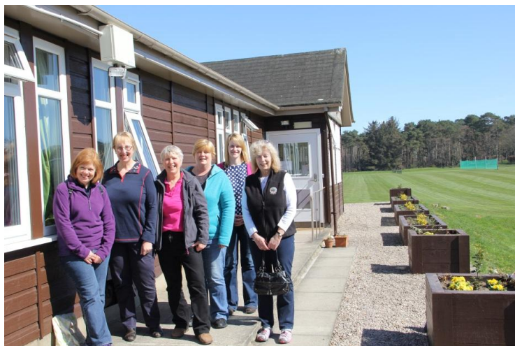
IFYE Scotland 2015

Looking forward to welcoming everyone to Scotland in August ☺