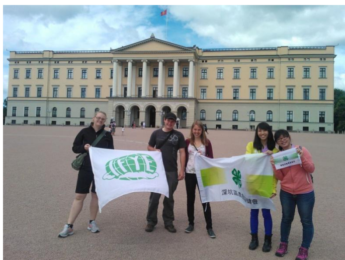
Welcome to Norway and Oslo...