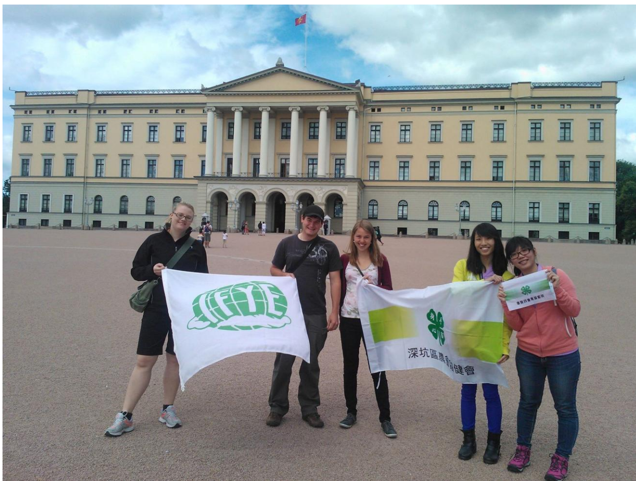
Some incoming IFYE's to Norway in Oslo, incoming weekend.