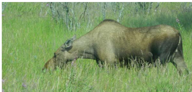
Moose on the road to Kenai River

See more about Dall Sheep at http://www.adfg.alaska.gov/index.cfm?adfg=sheephunting.main