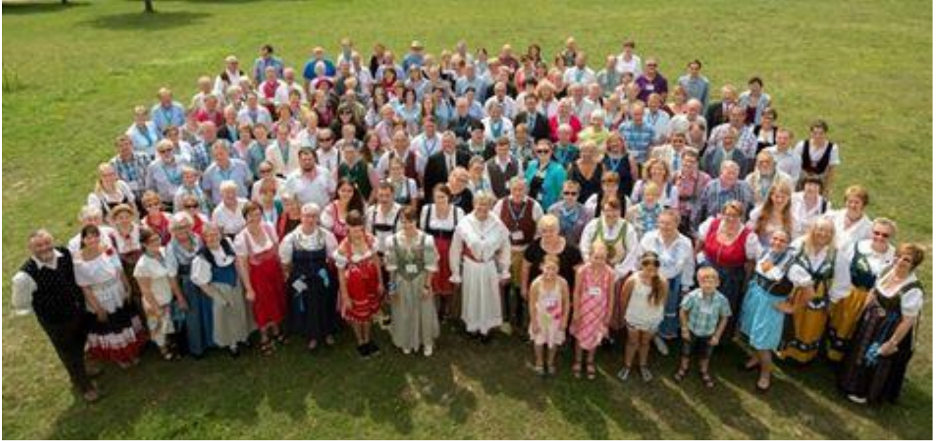
Bavaria – Germany's number one holiday region

Small medieval towns and vibrant cities Bavarian traditions and warm hospitality can be found all over the south east corner of Germany. Bavaria is one of the most popular – and most scenic – travel destinations in Germany. For many, Bavaria means sausage, beer, and lederhosen, and although you'll find all of that, Bavaria has much more to offer. Munich, the regional capital, and its picture-perfect countryside, unspoilt natural surroundings, healthy air, a wealth of culture and the proverbially laid-back attitude to life. Medieval castles and small towns, magnificent palaces and baroque churches, can be found all over the state providing the perfect setting for everything from traditional festivals to high flying hand gliders. This brings a harmonious blend of both the traditional and modern.