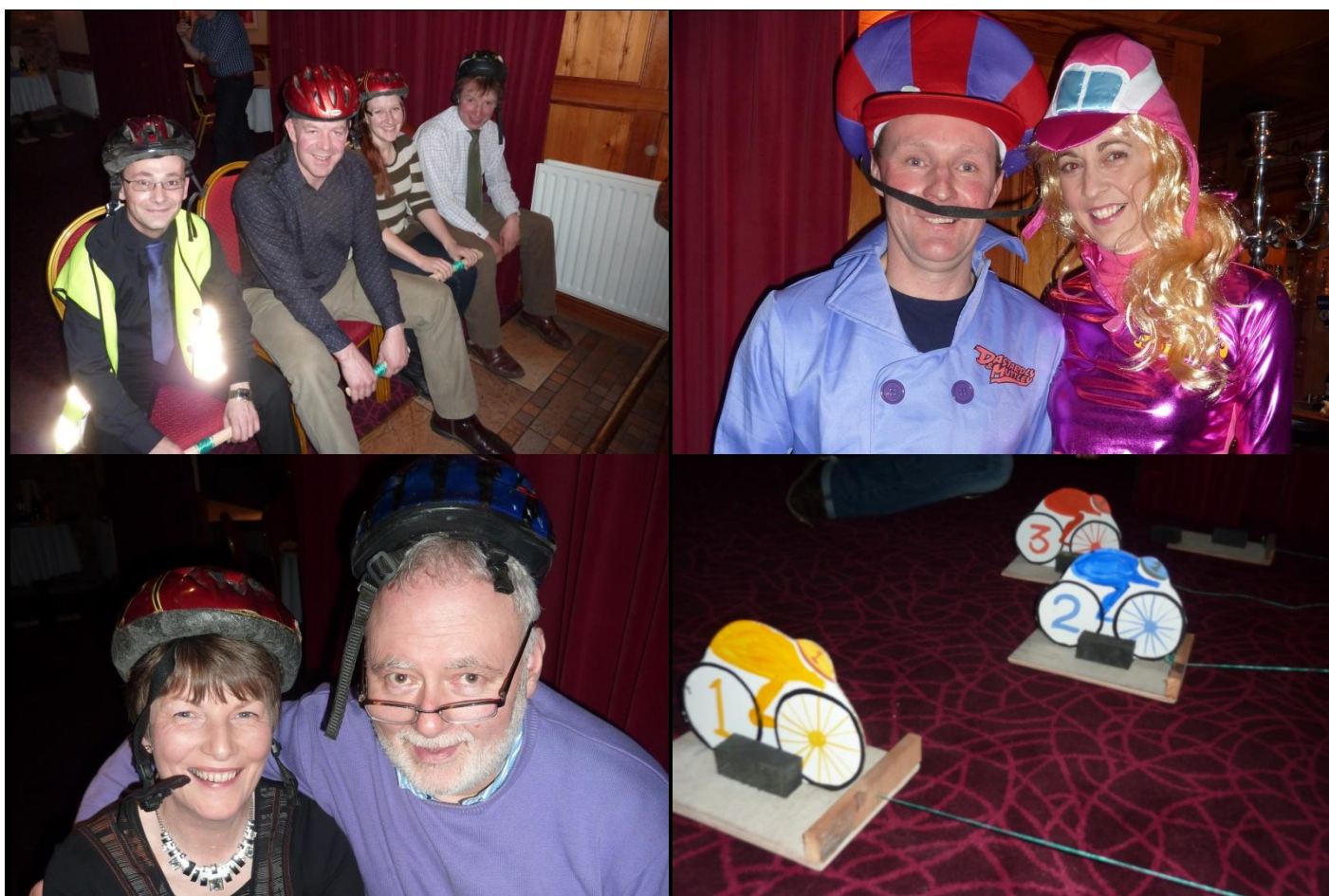
Annual dinner Northern Ireland