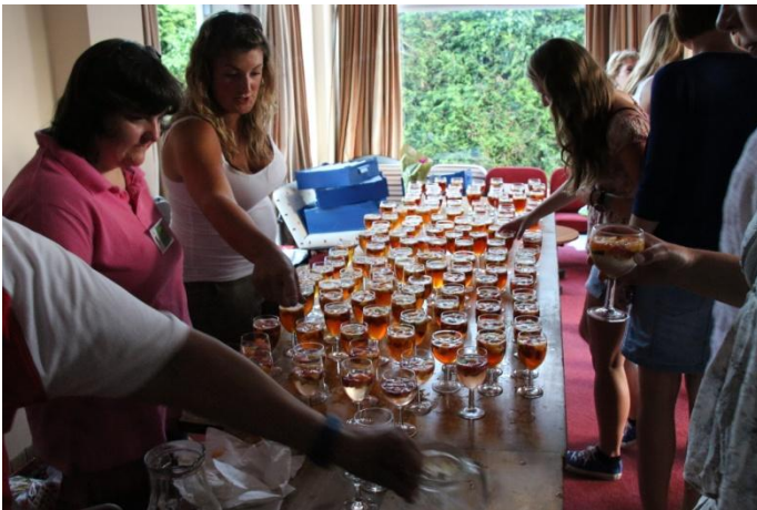
Treated with Pims

For the first time the European IFYE Conference took place in Wales in the historical town of Mounmouth. More than 150 IFYEs were ready to tame the dragon and to learn more about a new corner of the world. The Welsh committee had planned a great week for us and gave us a taste of Welsh culture with i.e Male Voice Choir, Eisteddfod competitions and welsh cake making.