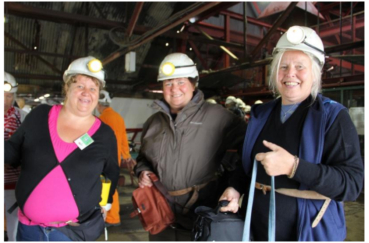
Going down the Big Pit