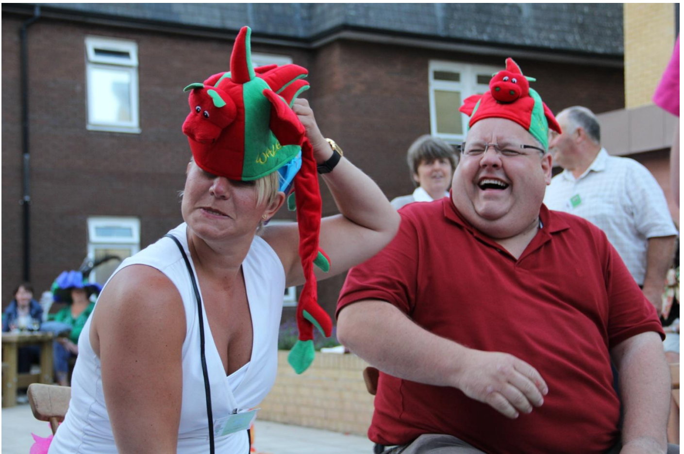
Dragon Race IFYE conference, Monmouth Wales