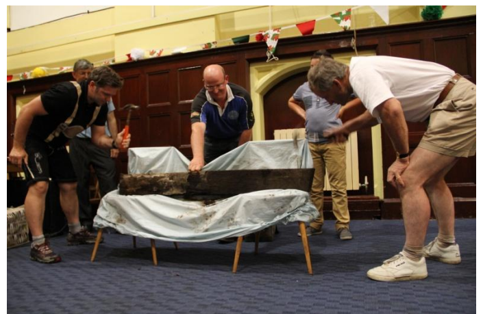
Nail in a log competition