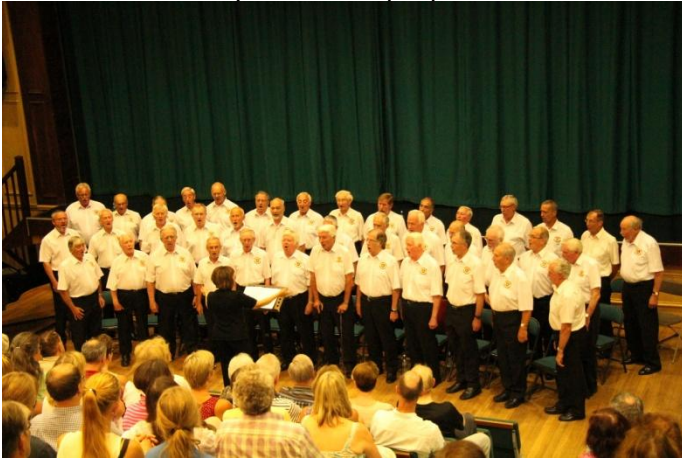
Chepstow Male Voice Choir

For the first time the European IFYE Conference took place in Wales in the historical town of Mounmouth. More than 150 IFYEs were ready to tame the dragon and to learn more about a new corner of the world. The Welsh committee had planned a great week for us and gave us a taste of Welsh culture with i.e Male Voice Choir, Eisteddfod competitions and welsh cake making.