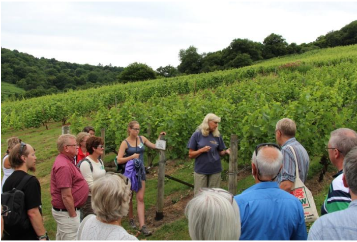
Parva Farmhouse Vineyard