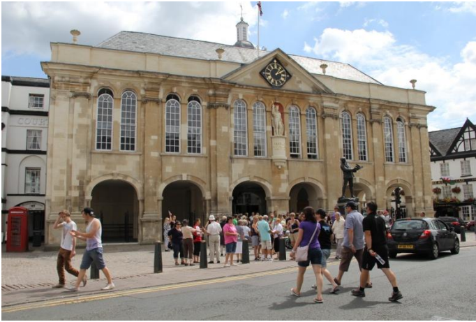
County hall – blue plaque trail