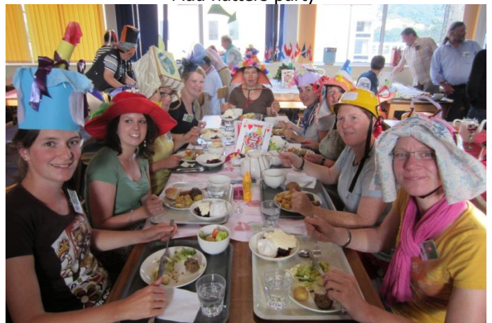
Mad hatters party dinner

Thanks to the Welsh committee and their families for their hospitality and hard work to make it an unforgettable IFYE week!