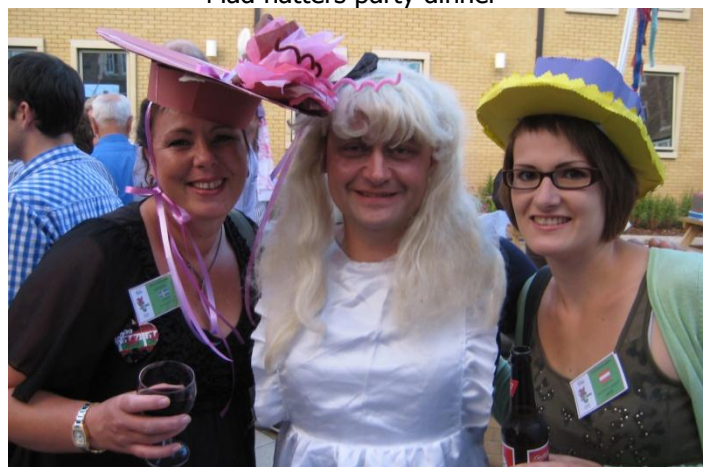
Ladies with hats