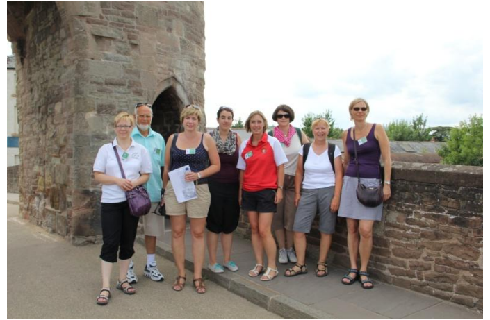
Blue plaque trail