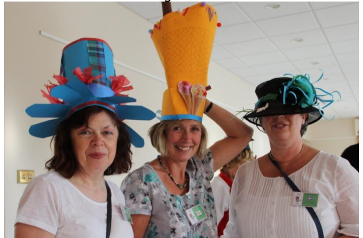
Mad hatters party

One day was an Eisteddfod competition day. This is a traditional Welsh song- and poetry competition/ festival. For the occasion it was a wide range of competitions and then the countries should form choirs for the final part of the festival and perform a song or five. Then a poem should be read out in welsh by a representative from each country! Unforgettable entertainment!