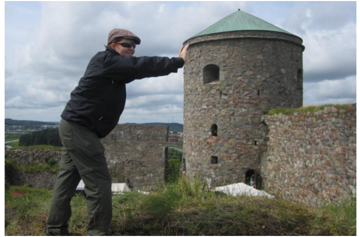
Helping to knock down the last part...(HWR)