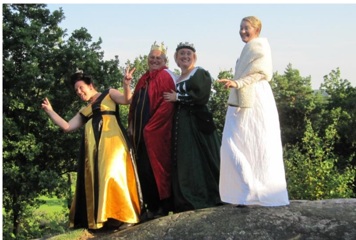
Royal craziness (HWR)