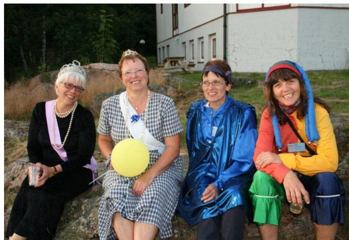
Mostly Swiss royals (MT)