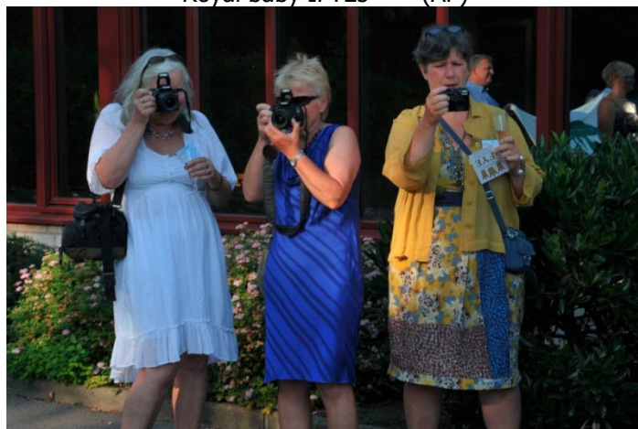
Make sure we have another picture of this (AF)