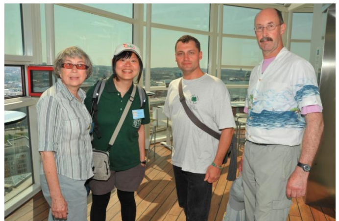
View over Gothenburg – still exploring (AF)