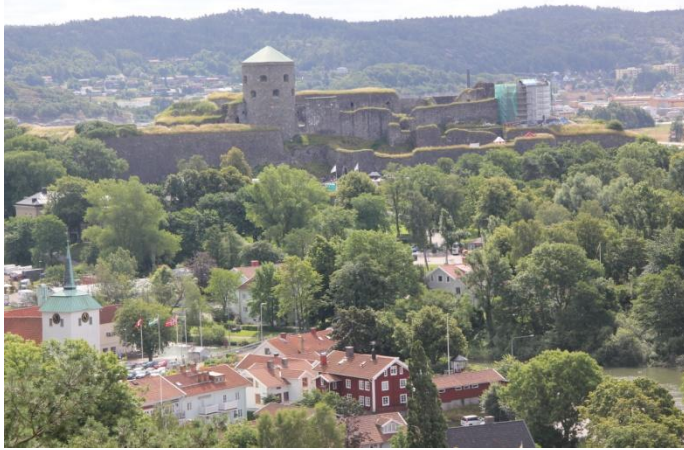
Bohus Fortress and Kungälv (PJ)