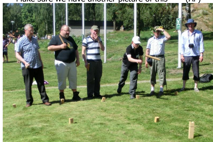
Playing Kubb at Midsummer (AP)