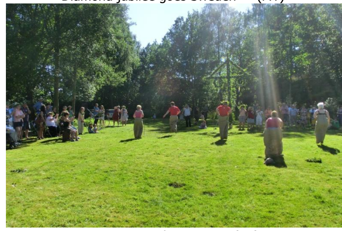
Games at Midsummer