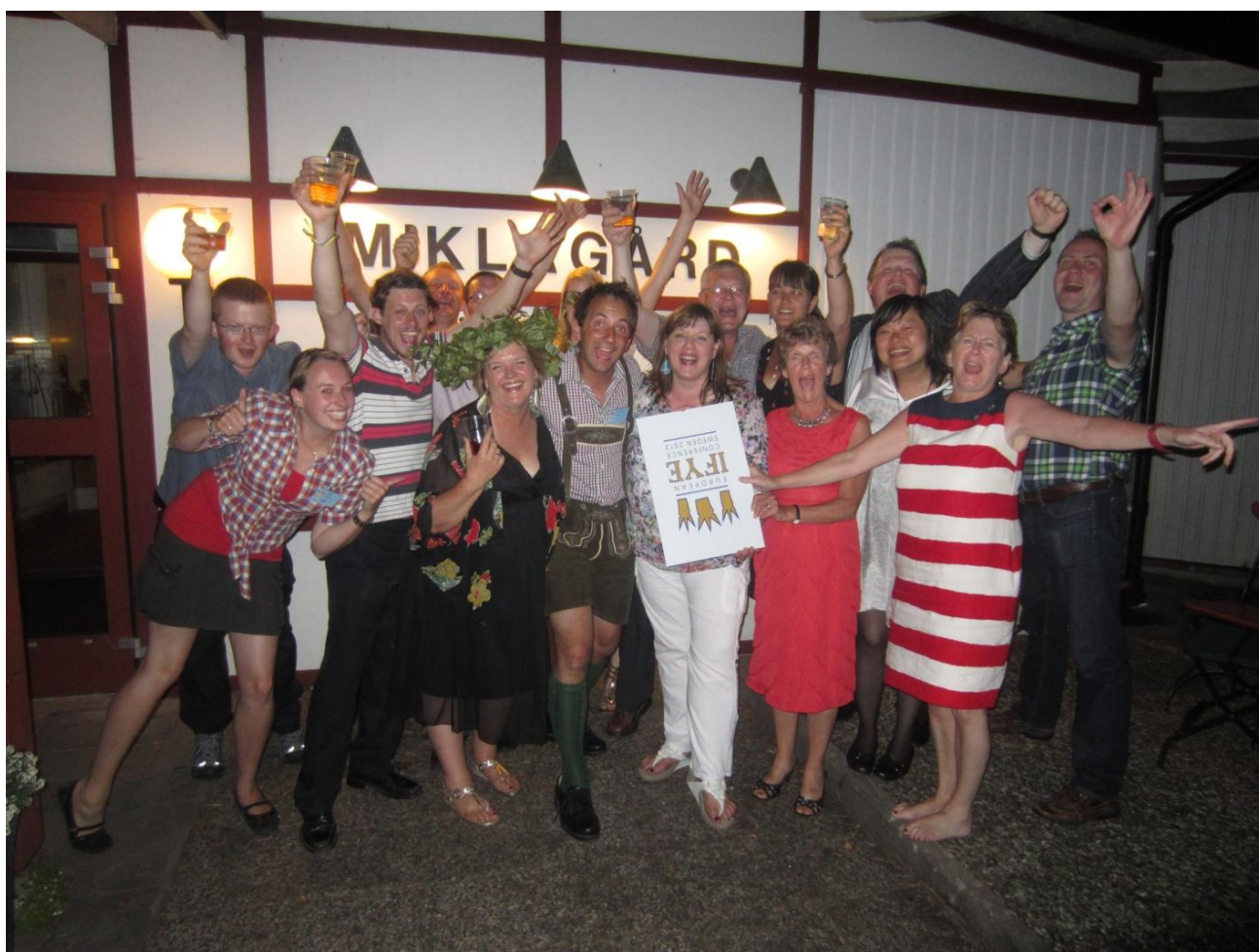
IFYE conference, Kungälv, Sweden 2012