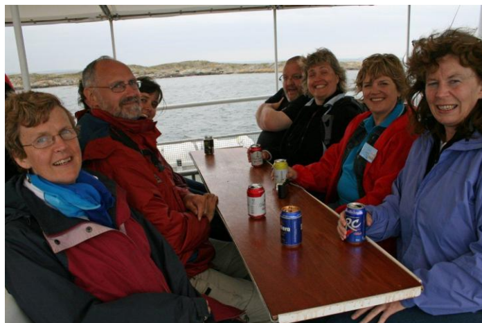
Boat trip to almost open sea (MT)