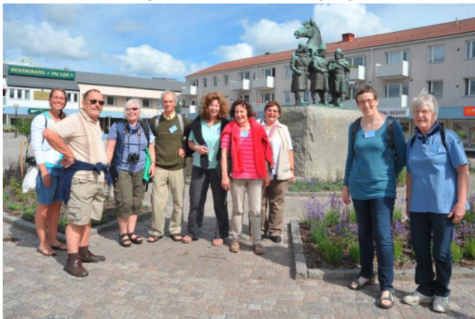
IFYEs and "the three kings" (AF)

It was a week of sun, fun and a royal touch took place in Kungälv. The location was the Nordic Folk high school overlooking the Bohus Fortress in the area where a historical meeting for the three Scandinavian kings took place long ago in very pre ancient IFYE time. Now we all gathered to a week filled with traditional activities, games, trips, meetings and parties. We had such a great week.