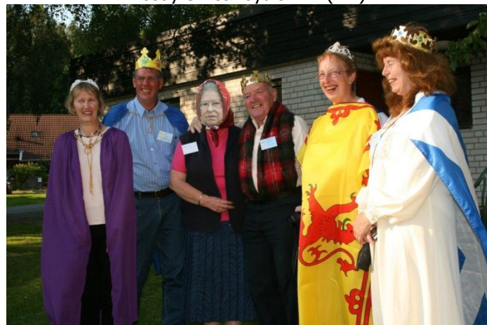
Diamond jubilee goes Sweden (MT)