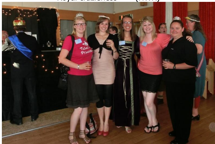
Royal baby IFYEs