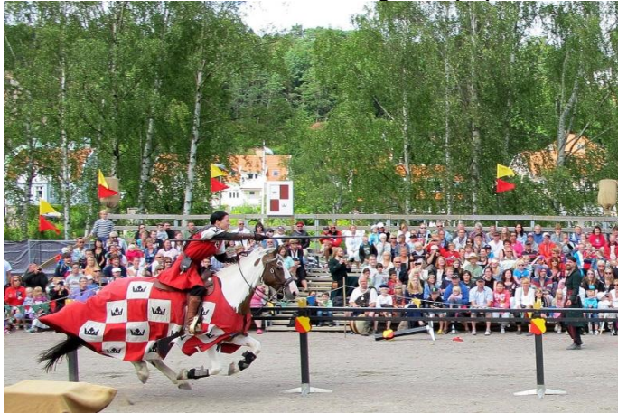
Knights tournament

It was a week of sun, fun and a royal touch took place in Kungälv. The location was the Nordic Folk high school overlooking the Bohus Fortress in the area where a historical meeting for the three Scandinavian kings took place long ago in very pre ancient IFYE time. Now we all gathered to a week filled with traditional activities, games, trips, meetings and parties. We had such a great week.