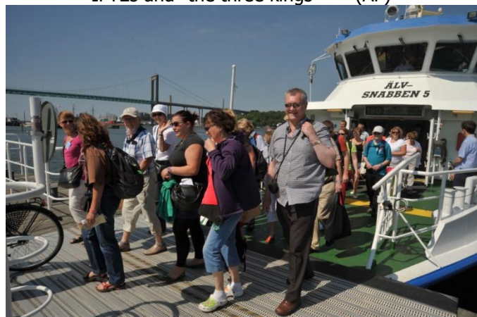
Exploring Gothenburg (AF)

"I enjoyed everything about the Swedish IFYE Conference - the venue, the programme, the beautiful location in Sweden, the relaxed atmosphere, the food, the weather... I could go on and on!"