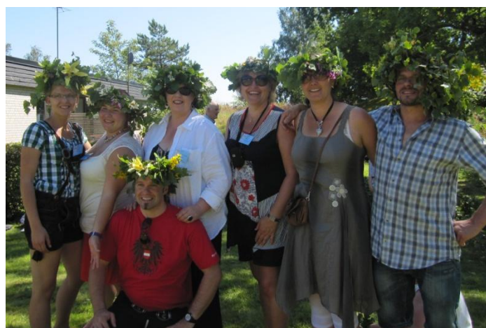
Self made wreaths - Midsummer (MK)