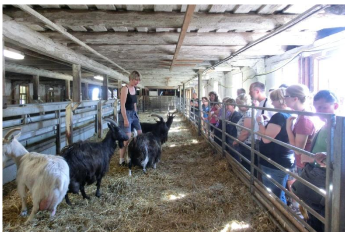
Halltorps mejeri, goat farm and dairy