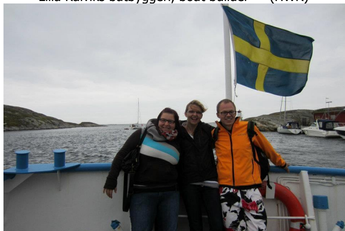
We are sailing.....(AE)