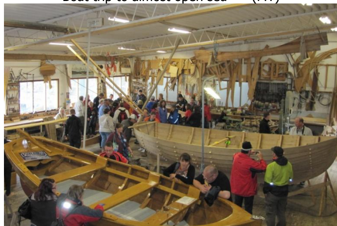
Lilla Kålviks båtbyggeri, boat builder

Pictures by: Arne Forbord (AF), Anita Eckerstorfer (AE), Hilde Hjelt (HH), Mari Kindsbekken (MK), Anette Paulsen (AP), Peter Jimmefors (PJ), Sally Young (SY), Mary Turner (MT) and Hilde W. Riser