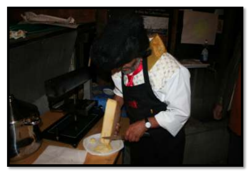
Raclette! Swiss dairy products are delicious!!

I cannot say thank you enough times to all my wonderful host families who took the time to teach and share their lives with me. And also, a big thank you to the countries of