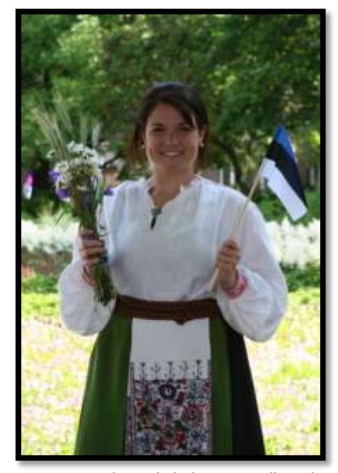
Wearing traditional clothing to walk in the parade at the 2011 National Song Festival in Tallinn. Estonia

I have so many memories from Estonia that I treasure and I'd like to