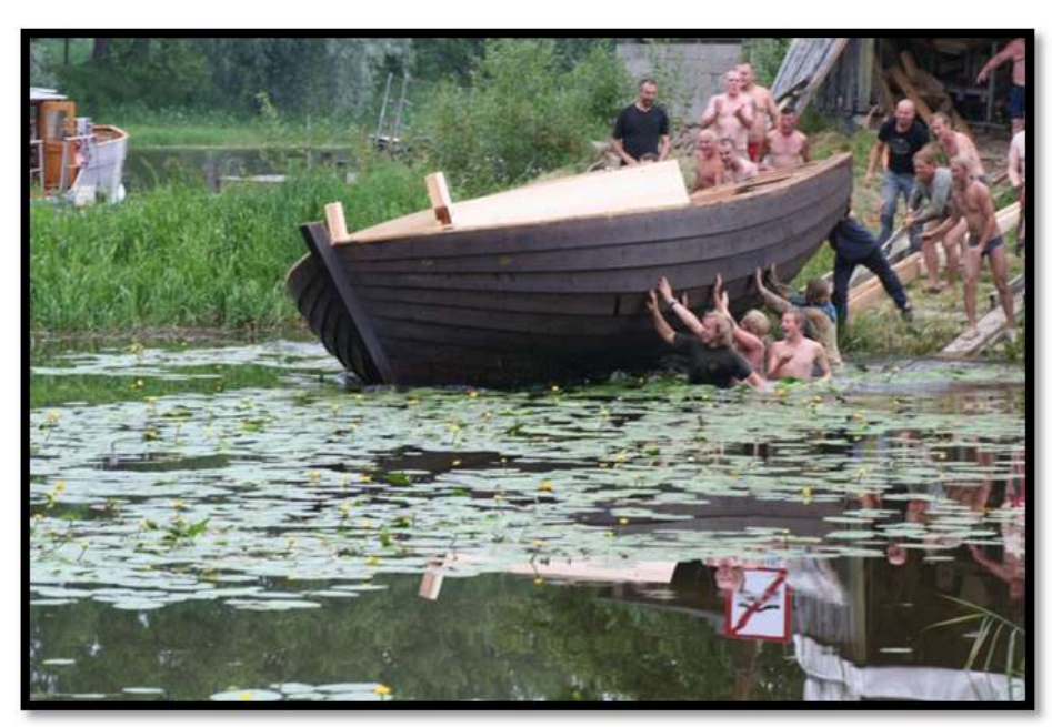
One of my host fathers was a master builder in a local ship building organization. These boats are all built by hand using techniques that are hundreds of years old! This picture was taken at the launch of their most recent project.

Life in Estonia has not been easy and the country is still recovering from more than 50 years of occupation by the former Soviet Union. It was fascinating to hear peoples' about the "Russian stories Times," and I got a first-hand account of what life was like behind the Iron Curtain. That said I have never met people that treasure their freedom as much as the Estonians.