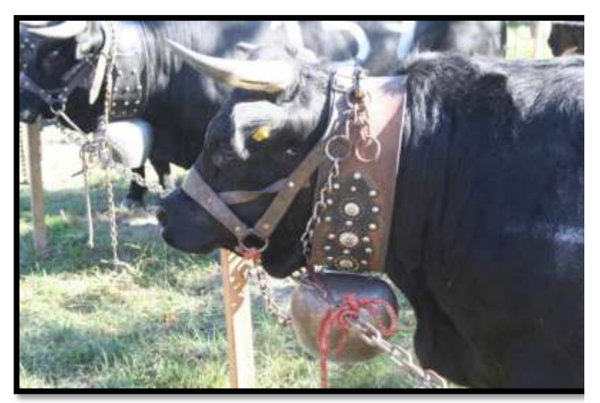
One of the fighting cows that participated in the annual "Cow Combats" in Martigny, VS. I can honestly say I have never seen anything like this before, and if I didn't have photographs as proof, I don't think anyone at home would believe me!

After the Valais I moved to my second Swiss host family in the canton of Solothurn. I think I was the ninth IFYE this family has hosted and I hope future IFYEs are lucky enough to stay with them! As a veteran host family, they helped make my time with them three weeks to remember. Although they don't live on a farm, they breed Labrador Retrievers and there is plenty of work to be done training and working with the dogs. During my stay with them I was able to take several beautiful hikes through the nearby forests and foothills, celebrate Oktoberfest, and even have a traditional raclette! I must say though that my favorite place we visited was the Jura World of Coffee, as a coffee connoisseur the Jura factory was a little slice of paradise!