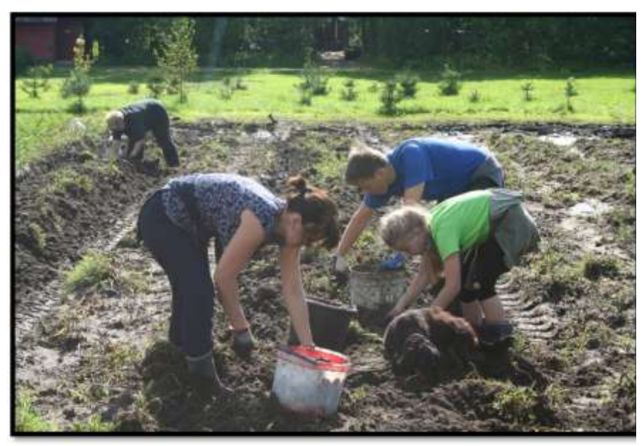
Digging potatoes by hand is a lot of work, but is a great opportunity for all the family to get together! in Parnu, Estonia

Their love of their traditions, language, and land was truly inspiring. Every two years in Tallinn (the capital city), Estonians celebrate their independence with a National Song Festival. festivals have long been a tradition in Estonia but since the collapse of the Soviet Union they have taken on an even more significant role in Estonian life. While many countries to fight to gain their independence from the Soviet regime, the Estonians chose to use their voices instead of weapons. In what is now referred to as a "Singing Revolution" the Estonian people banded together and held illegal singing festivals to protest Russian occupation. At these festivals the people sang national